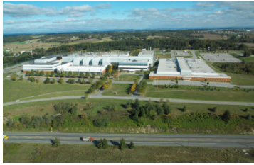
Technology Campus, Breingsville PA*