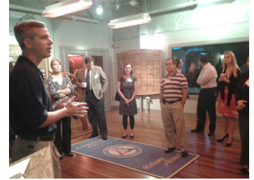
National Flight Academy, "Ambition"

http://www.cox.net/~naio/Default.aspx?PageID=1012472&eventID=75188&EventViewMode=%26calendarViewType=1&SelectedDate=9/24/2012