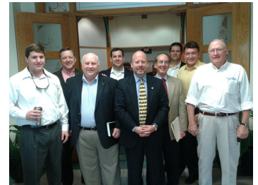
After the meeting with UWF